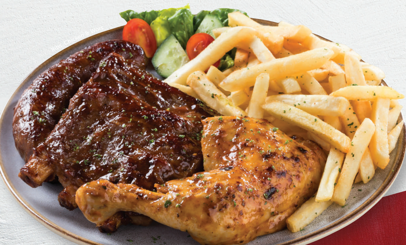
Ribs, Chicken & Wors

RIBS & CHICKEN 400 400g Pork ribs oven-roasted and basted, and 8 chicken wings. Served with your choice of either sticky BBQ basting, tikka sauce or spicy peri-peri sauce.