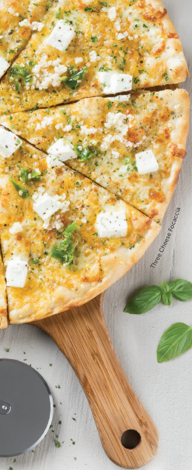
Three Cheese Focaccia