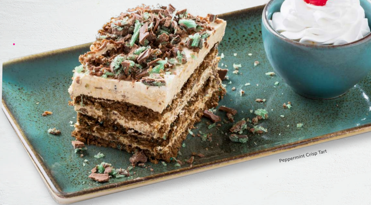
Peppermint Crisp Tart

PEPPERMINT CRISP TART 95 Crushed Peppermint Crisp pieces smothered between layers of fresh cream and caramel sauce, set atop a crunchy biscuit crumble. Served with cream or ice cream.