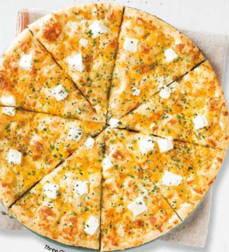
Three Cheese Flatbread

CHEESY GARLIC SNAILS 99.90 Snails drenched in garlic butter, topped with mozzarella and baked to perfection. Served with brown bread.