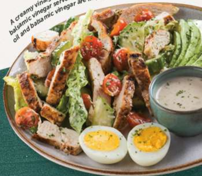
Chicken Caesar Salad