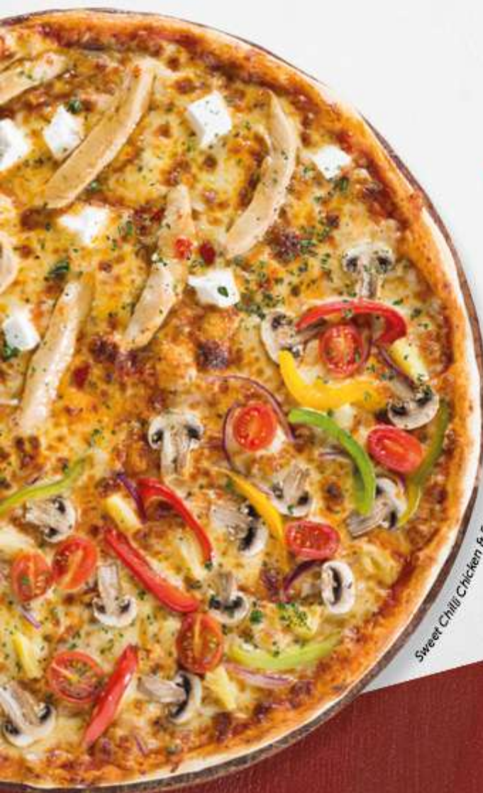
Sweet Chili Chicken & Feta / Vegetarian Monsterito Duo