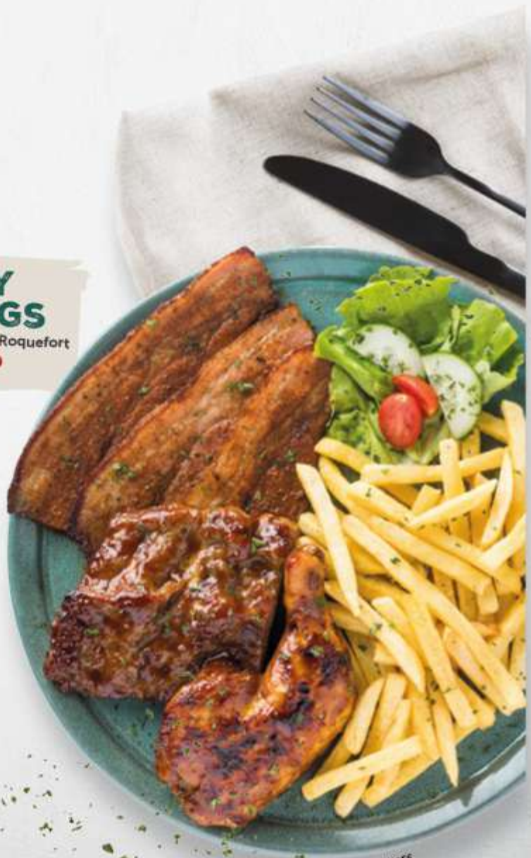
Ribs, Chicken & Rashers

RIBS, CHICKEN & RASHERS 268.90 200g Pork ribs oven-roasted and basted, a quarter chicken and 3 Cajun pork rashers. Served with your choice of either sticky BBQ basting, spicy peri-peri or tikka sauce.