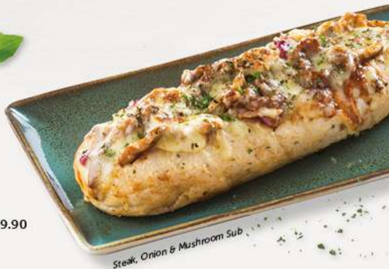
Steak, Onion & Mushroom Sub