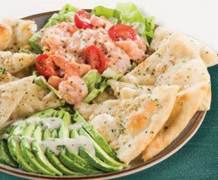
Avo Del Mare

A creamy vinaigrette dressing, extra virgin olive oil and balsamic vinegar served with our compliments. Our olive oil and balsamic vinegar are imported directly from Italy.