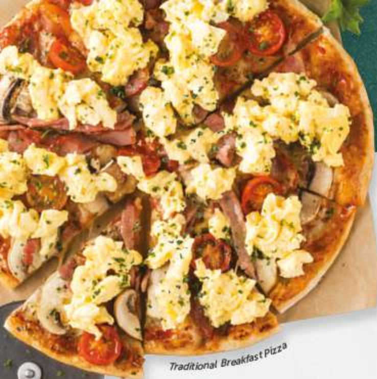
Traditional Breakfast Pizza