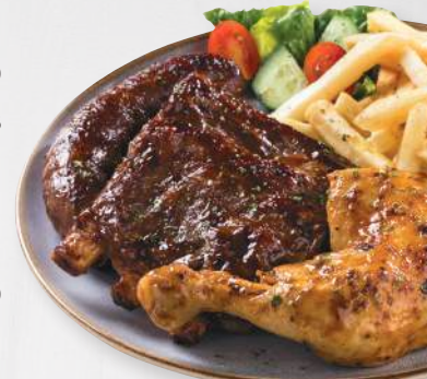
Ribs, Chicken & Wors Combo

Delivery available. Delivery fees apply. Available at Panarottis Pinnacle Mall only.